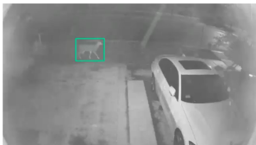
Deer Detected. (Sleep through the night. Camect Won't Send This Alert)