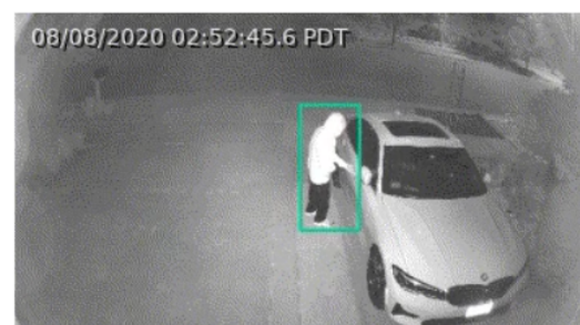
Person Detected. WAKE UP Camect Will Send This Alert Return to Table of Contents 8